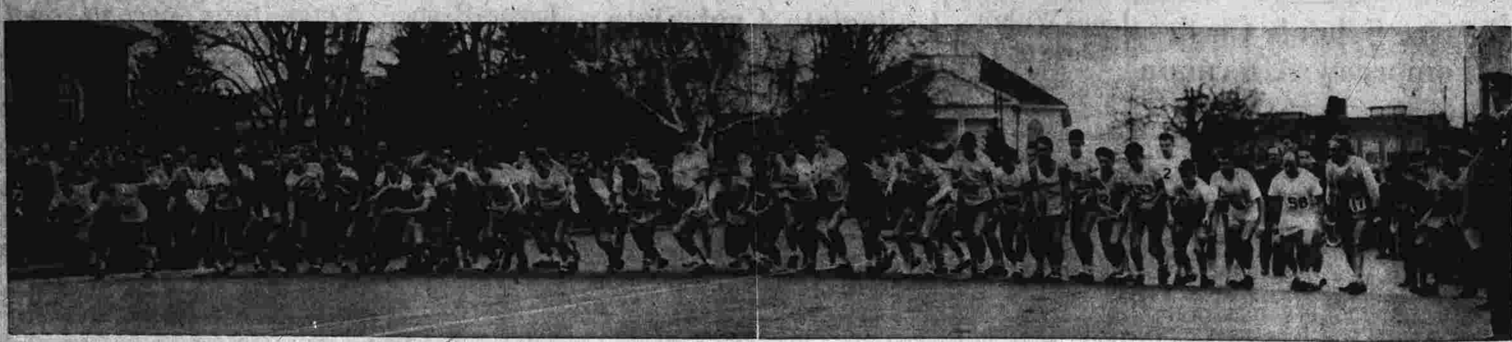
HARRIERS READY TO ANSWER GUN FOR START OF THE 18th RUNNING OF THE MANCHESTER TURKEY DAY ATTRACTION